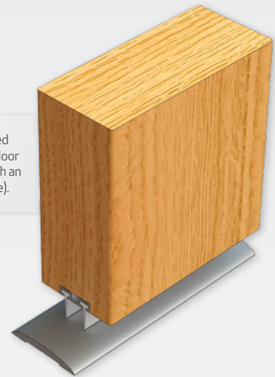
Right: IS3017si rebated to the underside of a door bottom (combined with an IS4120 threshold plate).