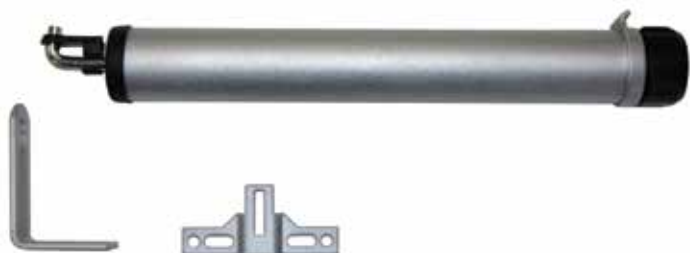
403 Screen Door Closer