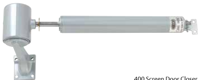
400 Screen Door Closer