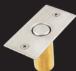
SAB80 Spring Loaded Floor Ferrule