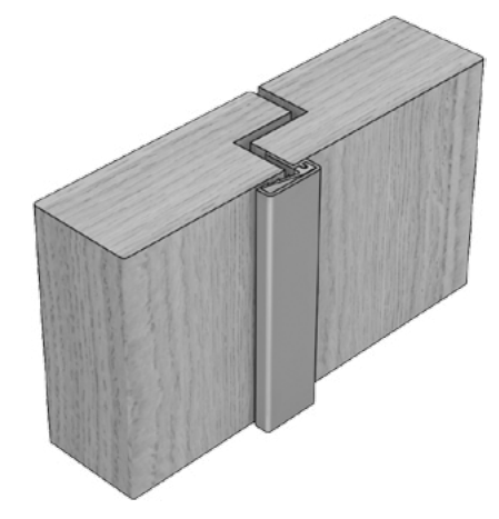
Rebated meeting stile installation