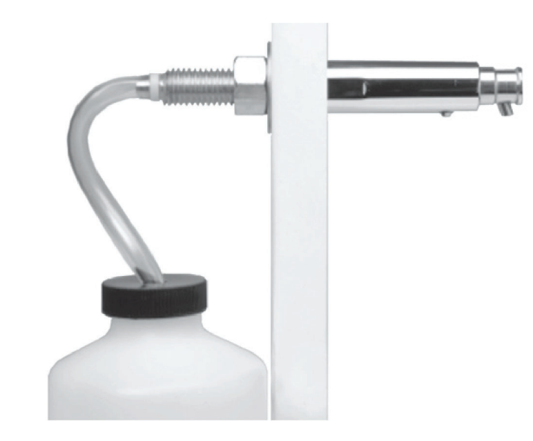
BOBRICK PANEL-MOUNTED SOAP DISPENSER

SYDNEY | MELBOURNE | BRISBANE | PERTH | AUCKLAND