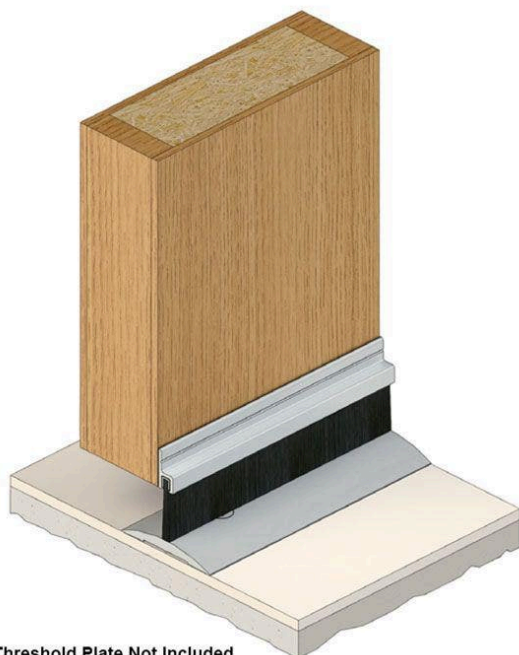
RP 82 Threshold Plate Not Included