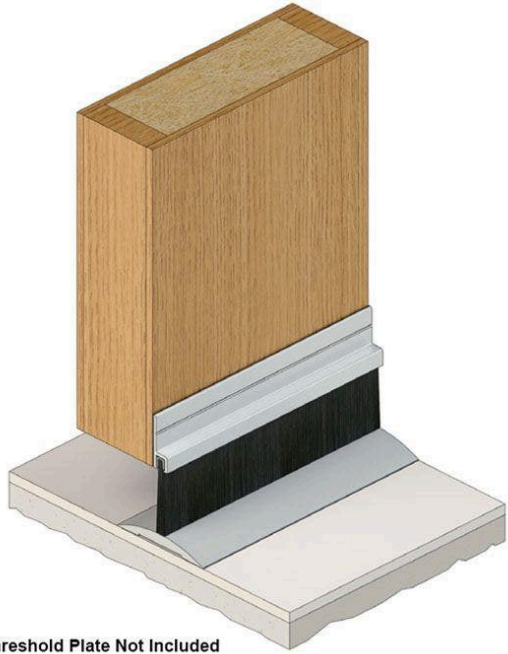
RP82 Threshold Plate Not Included