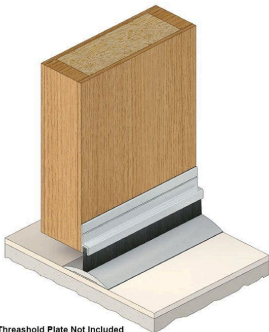
RP82 Threshold Plate Not Included